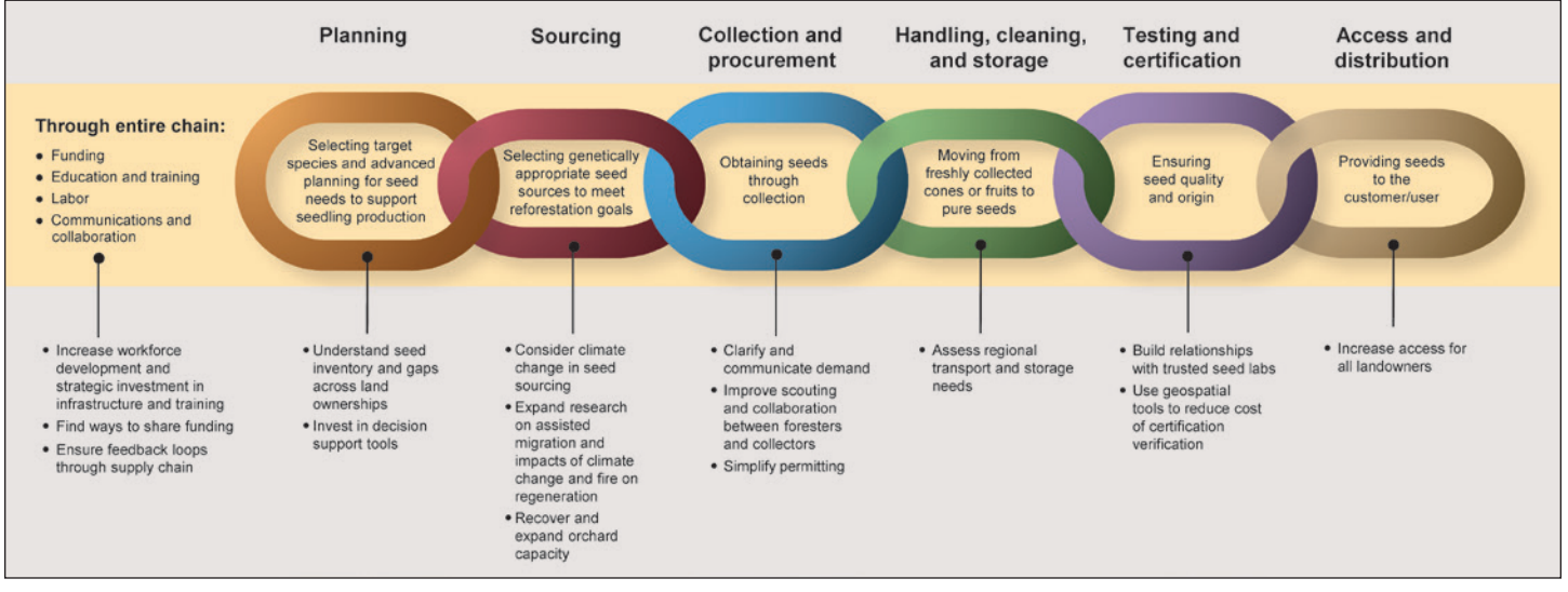
Figure 1. The tree-seed supply chain consists of six key elements. Each element has associated opportunities to strengthen them.

Additionally, areas with reforestation potential span Federal, State, Tribal, and private lands, thereby making up a complex mosaic of funding structures and management goals. Proactive planning for seed needs