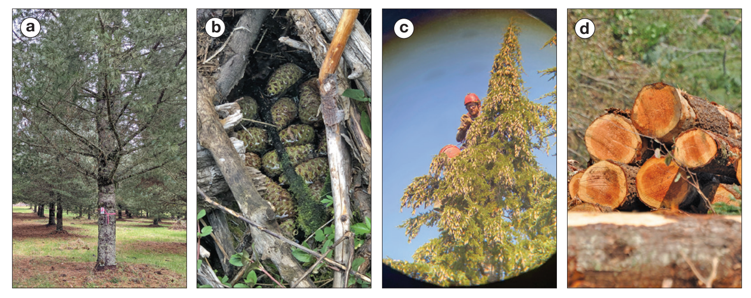
Figure 2. Methods commonly used for conifer cone collections in the Western United States include (a) seed orchard collection, (b) squirrel cache (or "ground") collections, (c) tree climbing, and (d) fell and pick.

orchards today may not prioritize genetic traits that could be critical for conserving ecological function and adaptive capacity as the effects of climate change intensify (e.g., drought and temperature tolerance, the timing of growth and reproduction, and other traits related to climate may be more important in the future than rapid growth or taper; Hänninen and Tanino 2011, Niinemets 2010, Rohde and Bhalerao 2007). Finally, due to reduced investments in tree improvement during the past several decades, many orchards have suffered and have reduced production capacity (Wheeler et al. 2015). While a need exists to better quantify the current and future potential of seed orchards to contribute to the reforestation seed supply, new orchards will take additional investment and will require at least a decade to produce seeds (Bonner and Karrfalt 2008, Puritch 1977). In addition, managing seed orchards will necessitate expertise and long-term maintenance to achieve desired seed production volumes and quality.